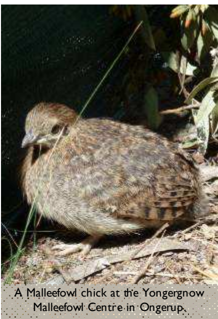
A Malleefowl chick at the Yongergnow Malleefowl Centre in Ongerup.