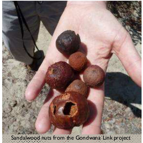
Sandalwood nuts from the Gondwana Link project