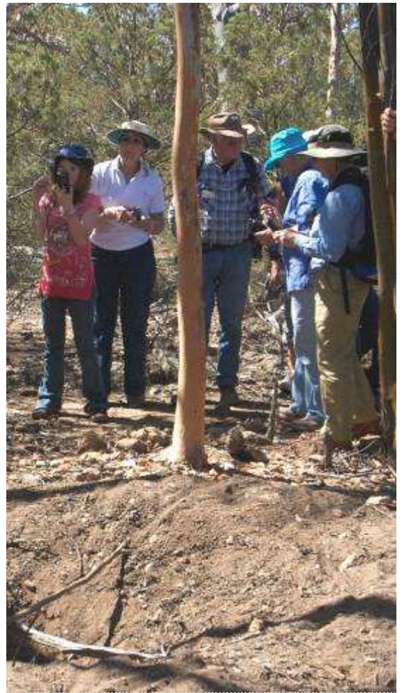
Volunteers practising with mobile mappers at the Merredin monitoring workshop.

This approach was so successful that the MPG's 2010 monitoring program was completed by the end of December for the first time ever: a very gratifying outcome from the workshop.