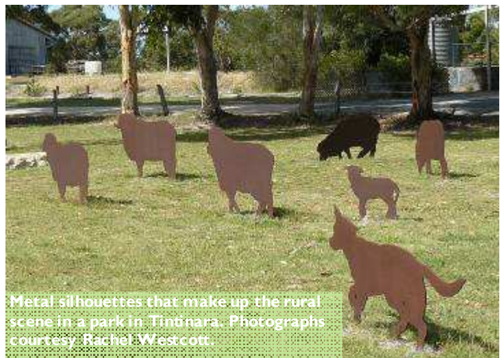
Metal silhouettes that make up the rural scene in a park in Tintinara.

Does the Malleefowl feature as an emblem in your area? If so, email or send a photo of your malleefowl emblem, along with the story behind it to Malleefowl Matter (contact details on page one).