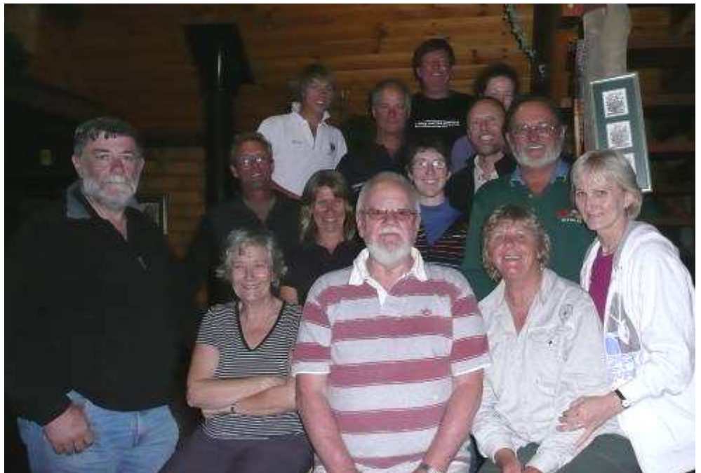
The intrepid group of Malleefowlers from South Australia who visited in January to check out all things Malleefowl.