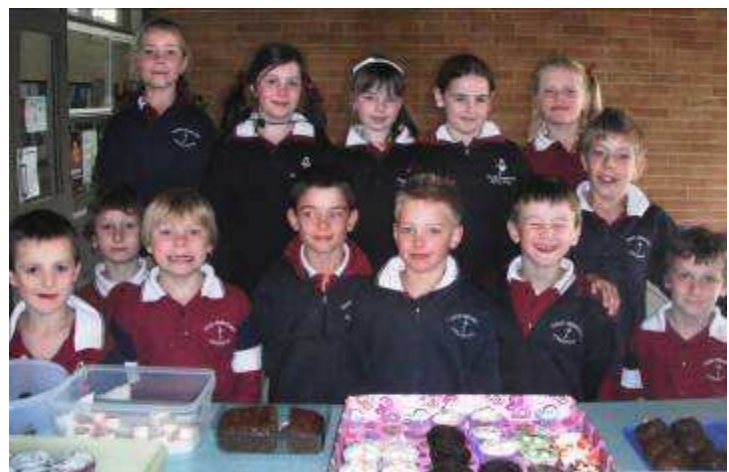
The students from Grade 2/3 at the Good Shepherd Lutheran Primary School manning the cake stall they set up to raise funds for the MPG's Community Conservation Trust.