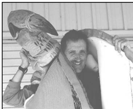
Woody's Wooing Welcome

Following a Malleefowl Magic Education week, the Malleefowl Preservation Group set up a display at the Dowerin Field Days in the Wesfarmers Landmark Pavilion.