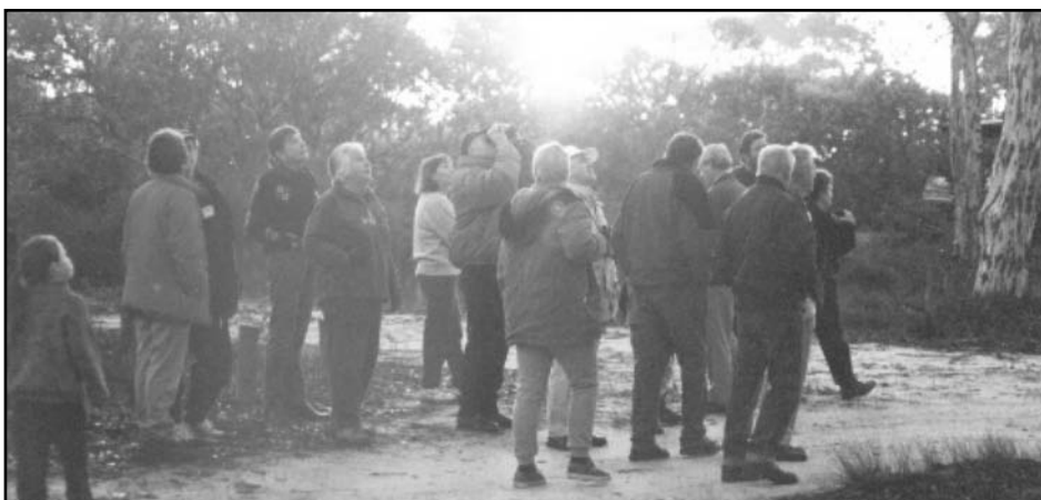
Early bird walkers