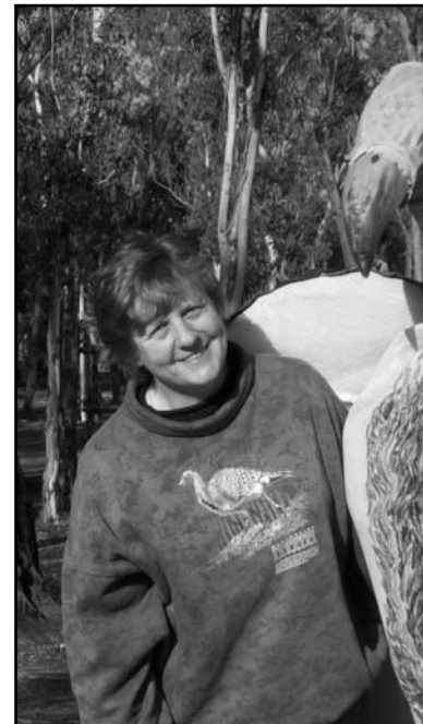
Star of the show with costume and new MPG Chairperson

A big thank you to all those who helped and encouraged me to make the costume, and congratulations Malleefowl Preservation Group on your 10 year achievements.